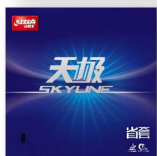
[有机] 省套 天极2-蓝海绵

STG2-L--红双喜省套天极2蓝海绵反胶套胶 (规格: 2.1/2.2, 黑, 39/40) -零售指导价370元