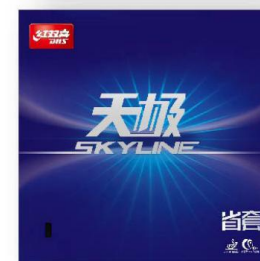
[有机] 省套 天极3-蓝海绵

STG3-L--红双喜省套天极3蓝海绵反胶套胶 (规格: 2.1/2.2, 黑, 39/40) 零售指导价370元