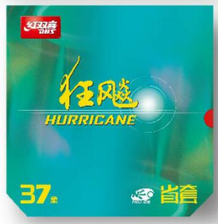
[无机] 省套 狂飚3-37柔

N. SH3---红双喜NEO省套狂飚3反胶套胶 (2.1/2.15, 红/黑, 特柔37度) -零售指导价430.00元