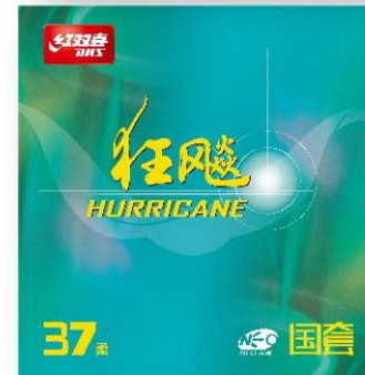
[无机] 国套 NEO狂飚3-37柔

N. GH3--红双喜NEO国套狂飚3反胶套胶 (2.1/2.15, 红黑, 特柔37度) -零售指导价695.00元